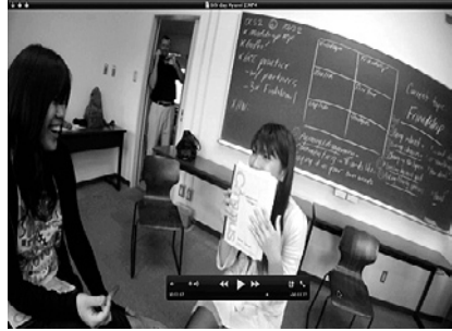
Video capture 2: Student's view of activity

mation of what students see. Students can, of course, hold their heads still and look elsewhere, and the camera is approximately 6 centimeters higher than their actual eye-level, but it provides an exceptional record of one participant's experience. A corresponding disadvantage is that it is still just one view , and in my OCS courses only one of 11 to 15 participant perspectives. By seeing and hearing what a student and his or her partner are doing during tasks, however, the teacher is better able to make informed pedagogical decisions, assuming that other students would interact similarly. This assumption can be problematic, but when individual differences — enhanced by viewing a number of students over several class meetings — are taken into account, the result can be productive. In fact, the process of reviewing videos has helped me better understand both individual students and the classes in general .