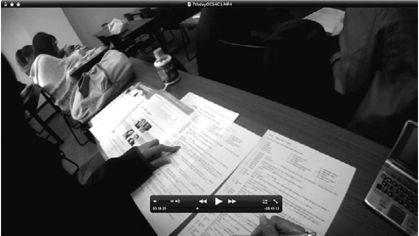
Video capture 5: View of GoPro-derived collaborative activity

1978), making it easier to access and engage in.