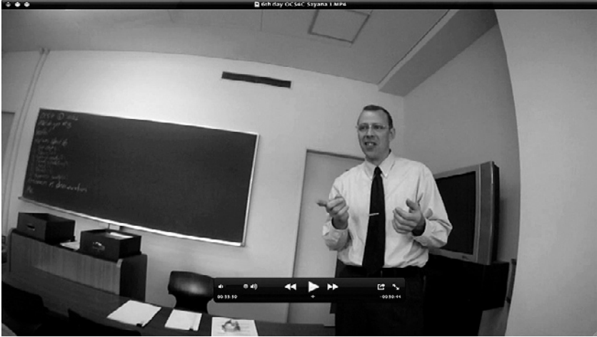
Video capture 4: Student view of teacher's explanation

and expression. I extracted a 3-minute excerpt of my explanation of the word “worthy” — a vocabulary item in the textbook — during individualized teacher to student instruction (Video capture 4). Because the second class, OCS4•D, had also asked about the word, I used the OCS4•C clip for both sections — the first time I had done so with GoPro excerpts (Appendix 2). Students seemed actively engaged in trying to match the gestures and expressions listed at the top of the handout with when they occur in the transcription, especially with the help of a partner (Video capture 5). Besides bringing attention to nonverbal aspects of communication, this procedure also provided students with a number of useful expressions for talking about the topic. I got the impression, however, that OCS3•C was more active and interested in the activity than OCS4•D. There may be several reasons for this, and possibly these could be explored in future studies, but it appears that there is greater interest in recordings from students’ own classes, which, being of their actual production, is set in their Zone of Proximal Development (ZDP) (see de Guerrero & Villamil, 2000; Vygotsky,