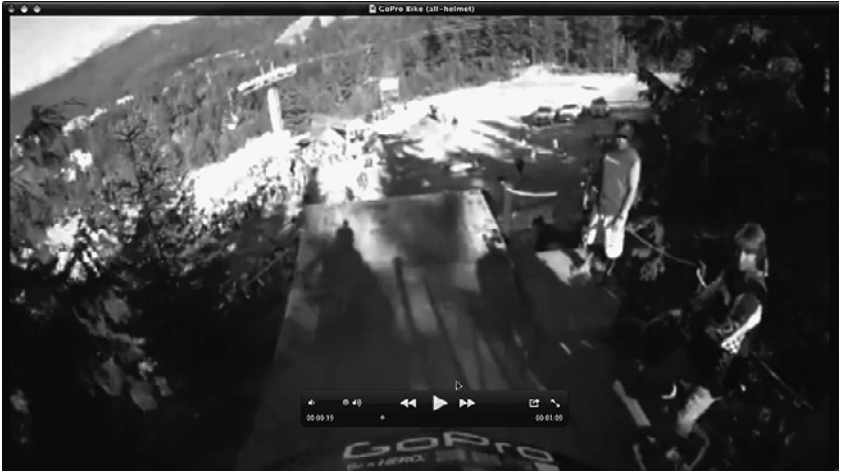
Video capture 1: BMX rider wearing a helmet HERO

classes in particular. After some time to contemplate the idea, I showed students the camera and told them I would like to be able to see the class through their eyes, something that teachers rarely see, and I asked for general permission to use the camera and for a volunteer. In all 4 classes, agreement to make GoPro recordings and the first volunteer came quickly.