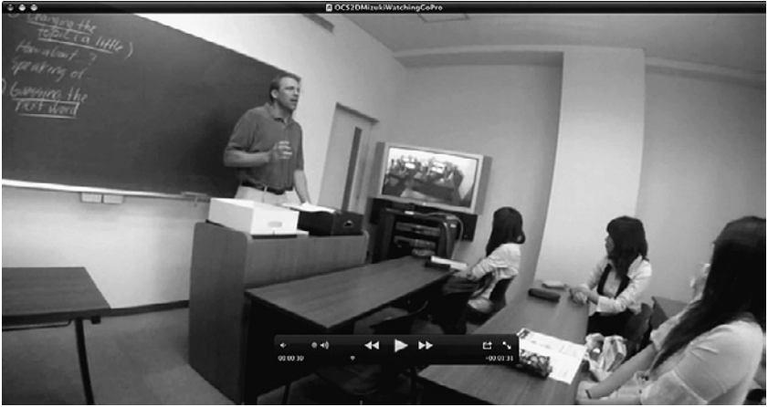
Video capture 3: Capturing instruction

not yet have an external microphone, however, so it is often difficult to hear the wearer's partner in student conversations — especially when other students are talking. This problem can be overcome by asking partners to speak clearly and sit close to the wearer or by using IC recorders or other supplemental recording equipment, though that increases the technological burden on the teacher.