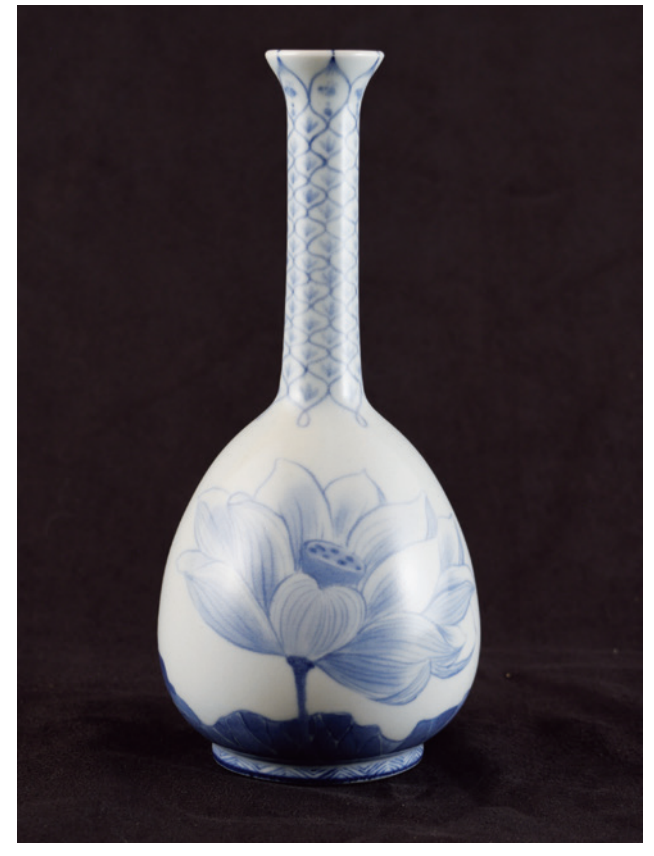
Lotus Vase, 2023 Flow in Flower, ICE CREAM LABS, Bangkok. 11x11x26 cm., Porcelain, Cobalt, Clear Glaze 1300 C.

デザイン学科・助手 Department of Design・Research Associate スタッス ベン Bente SUTAS