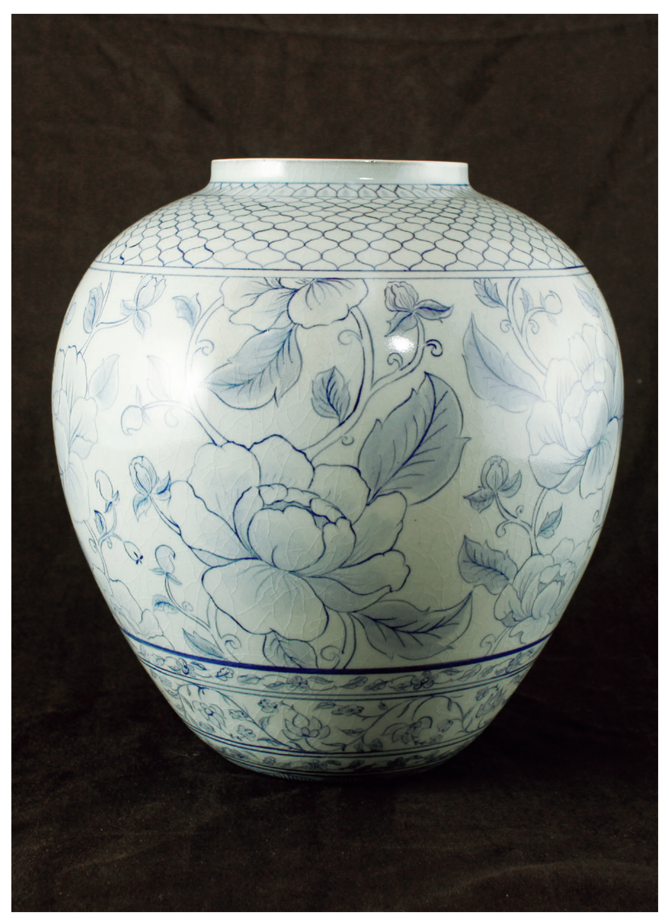
Peony Jar, 2022 作陶三人展, Palette Gallery, Tokyo. 30x30x35 cm., Red Clay, Engobe, Cobalt, Clear Glaze 1240 C.